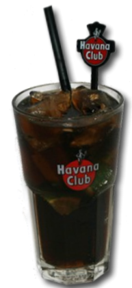
Viva Cuba Libre!