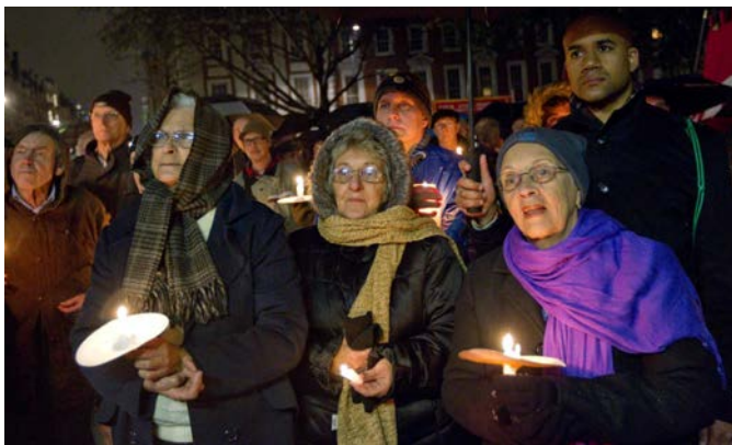
Mothers of the Miami 5 at vigil