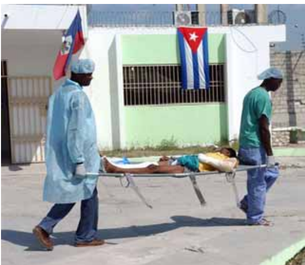
A Cuban flag flies alongside the Haitian flag outside a field hospital

That so many people died in Port au Prince on 12 January can not solely be attributed to the aching poverty which exists there. Blame also lies squarely at the feet of the international community and especially the US for their actions in the country in recent years. While many press reports focus on the humanitarian disaster and suffering caused by the quake, they do a disservice to the Haitian people by not exposing the policies that caused the poverty and exacerbated their suffering in the first place.