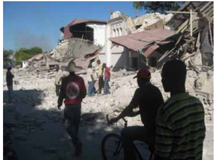
Port-au-Prince following the earthquake

Just 30 years ago, the country was self-sufficient in rice. But the IMF bullied the government into accepting loan conditions which slashed import duties on the crop. Local agriculture and livelihoods were decimated as the island became a dumping ground for heavily subsidised US rice. Haiti's Arbonite Valley, once home to thriving communities of farmers, now has one of the highest child malnutrition rates in the country. Impoverished families have had little choice but to leave their homes and land and move en masse to the overcrowded capital. Here they live cheek by jowl in makeshift dwellings, trying to eke a living in a country where fifty per cent of the population earn less than US$2 a day.