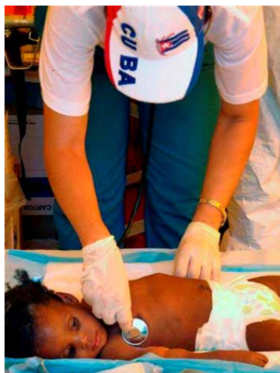
Cuban medics are treating 2,000 patients a day