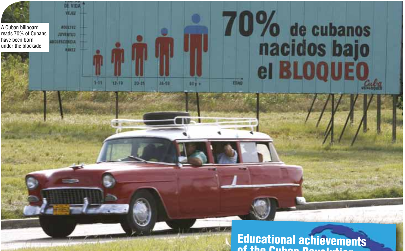
A Cuban billboard reads 70% of Cubans have been born under the blockade