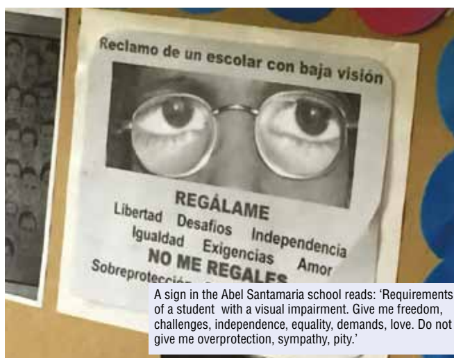
A sign in the Abel Santamaria school reads: 'Requirements of a student with a visual impairment. Give me freedom, challenges, independence, equality, demands, love. Do not give me overprotection, sympathy, pity.'

difference being the way in which materials are adapted, additional resources (such as braille machines) are provided and additional support is given by medical professionals. The school has a full-time optometrist who works with students one-to-one and in small groups, and class sizes are significantly smaller than in mainstream schools. Throughout, there was an ethos of respect and equality which was perfectly captured by this sign in one of the classrooms.