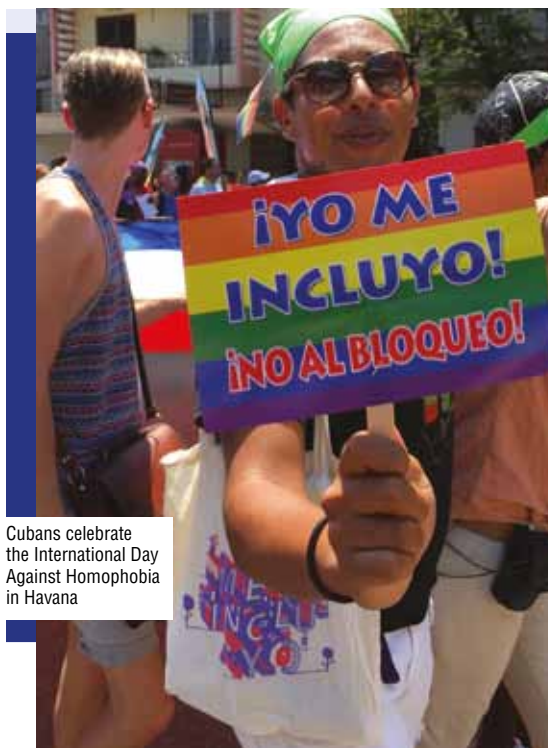
Cubans celebrate the International Day Against Homophobia in Havana

Following the decriminalisation of same sex relationships, and equalisation of the age of consent at 16, in 1979, a number of education initiatives and changes in the law marked the beginning of changes in government and societal attitudes to LGBT+ rights. A law passed in 2008 allowed for sex reassignment surgery to be made free and in the same year assisted reproductive technology for lesbian couples became available. Since 2008, Cuba has celebrated the annual International Day Against Homophobia and Transphobia (IDAHO) on 17 May with a march and a fortnight of events including conferences, panel discussions, debates, films and cultural events. In 2012, Adela Hernandez became the first known transgender person to hold elected public office in Cuba.