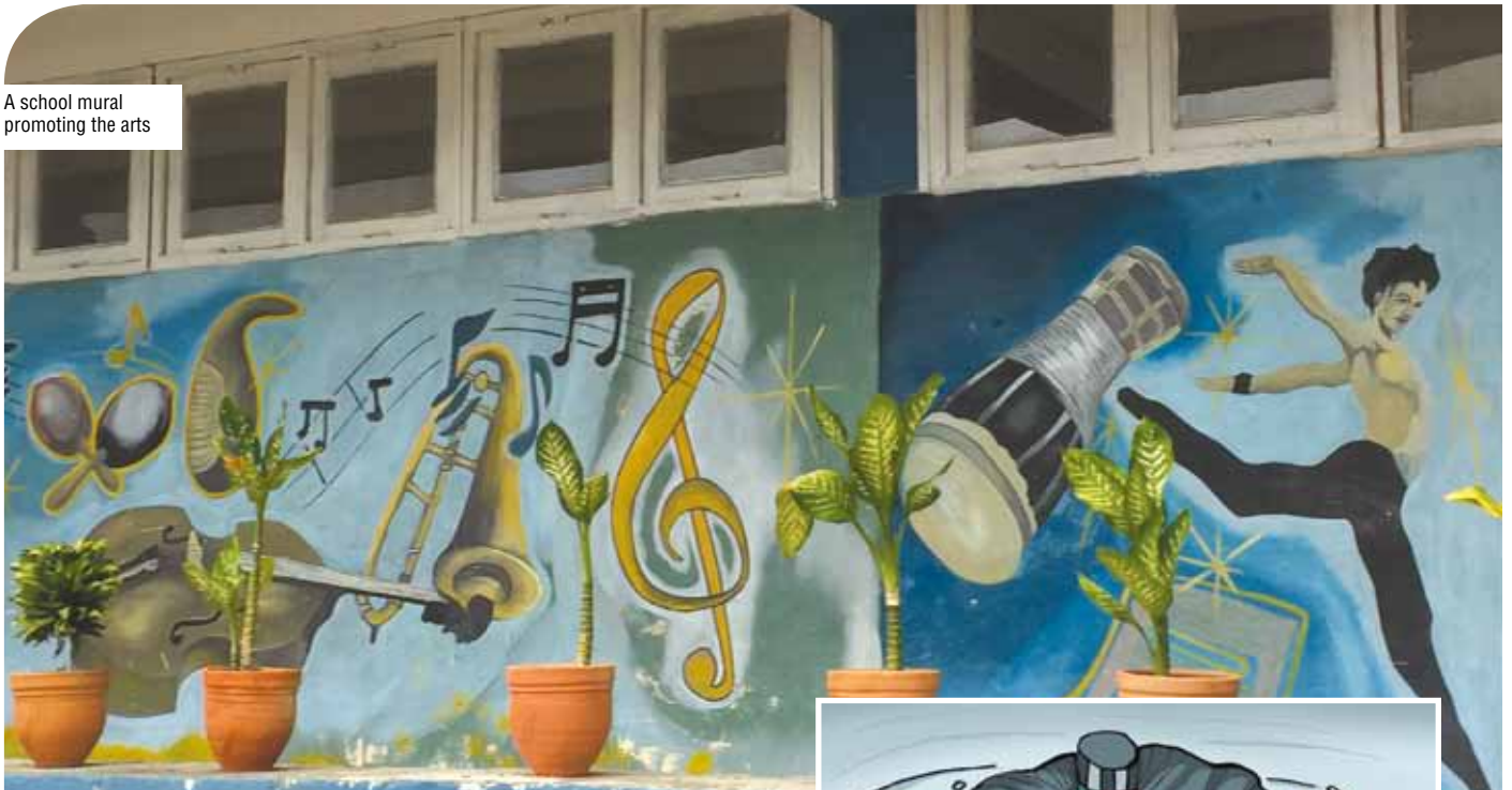
A school mural promoting the arts